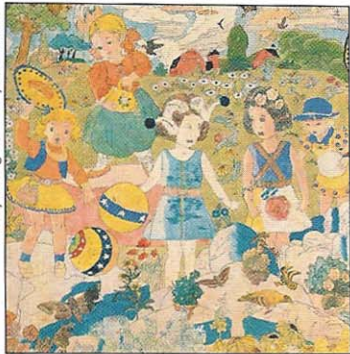
Henry Darger. Highlights from the American Folk Art Museum, The Andy Warhol Museum, Pittsburgh, February 5 – May 7, 2006.

A Henry Darger exhibit at the Warhol seems appropriate. After all, it could be debated Darger (1892-1973) was a proto-Pop artist, appropriating many images from mass-media sources. Approximately fifty creations, an annex exploring his creative methods and one bound volume of his 15,000-page novel, The Story of the Vivian Girls... telling of his spunky, prepubescent heroines who fought the 'Glandelinians,' an army of mustachioed men is present. A characteristic creation is We Will Slam Them With Our Wings , featuring a gaggle of blonde girls loitering in a surreal landscape of palm trees, cacti and massive flowers composed of watercolour, carbon tracing and collage.